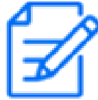
Feedback on assignment