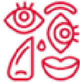
Interviews/ case studies